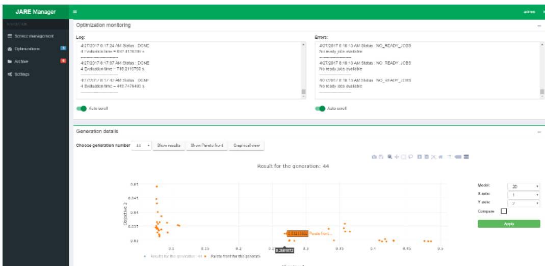
Fig. 2 - JARE Manager, user view. Monitoring the objectives in real time