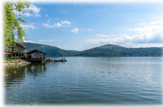
Cruises along the Danube