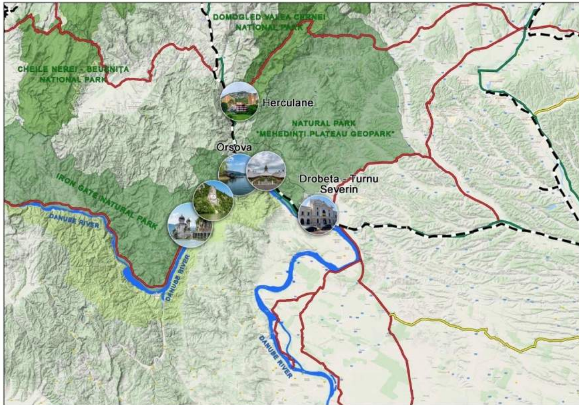
Fig.1 Iron Gates – RO Pearl

Iron Gates - RO Pearl is a region along Danube river included in two different counties Caraș Severin county and Mehedinți county, located in the South – Western part of Romania. The Danube River stands as the physical and administrative south border with Republic of Serbia creating the impressive Iron Gates.