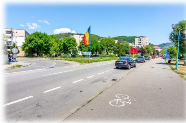
Cycling path in Orsova municipality