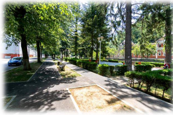
Cycling path in Baile Herculane resort