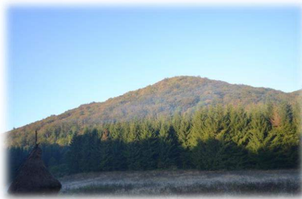
Mountain route for horse riding