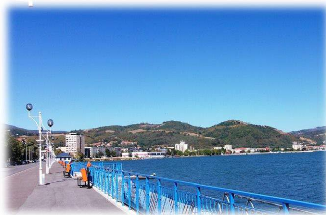
Orsova – Danube shore ( http://4run.ro )