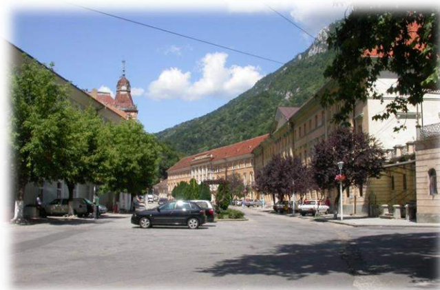
Location of the future bike rental center – Baile Herculane resort