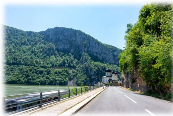
Cycling path in the area of the Danube Boilers