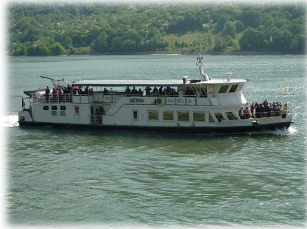
Dierna cruise ship ( http://www.informatii-romania.ro )