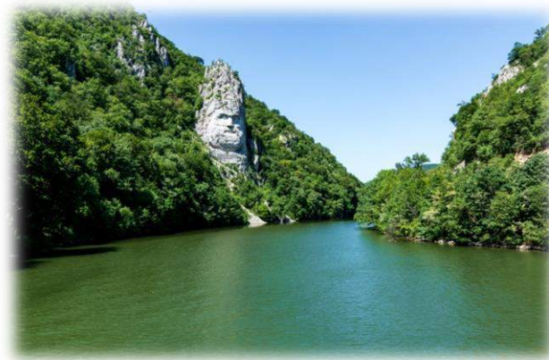
The carving of the Face of King Decebal (Mraconia Bay)