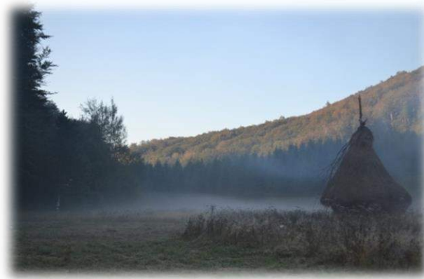
Mountain route for horse riding