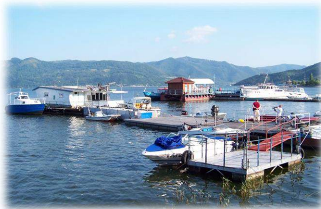
Orsova Port