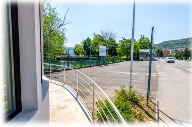
Location of the future bike rental center – Orsova Municipality