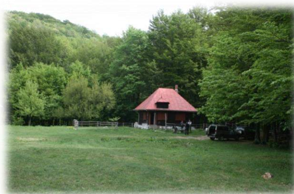
The location for the horse riding centre