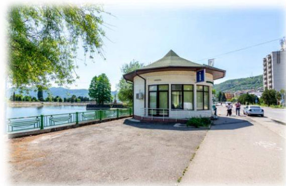
TMIC in Orsova (in the premises of the Tourism Promotion and Information Center)