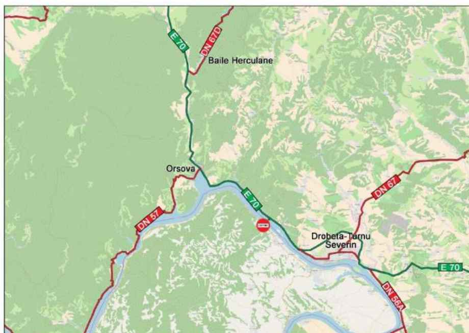
Fig.2 Iron Gates Pearl – RO, national and European roads

Running in parallel with the Danube bank, there is one major road (E70 – connecting southern Romania with its western part) that has a continuation in the north (from Orsova to Baile Herculane and Timisoara) and in the east (from Drobeta Turnu Severin further to Craiova and Bucharest). Going further, in parallel with the Danube bank, the road goes along DN 57 Orsova – Pojejena.