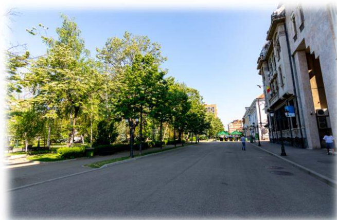
Location of the future bike rental center – Drobeta Turnu Severin Municipality