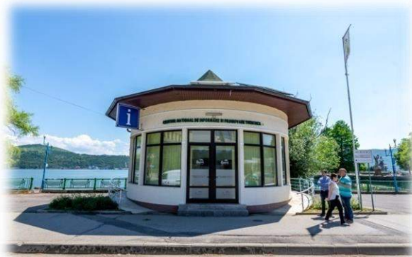
TMIC in Orsova (in the premises of the Tourism Promotion and Information Center)