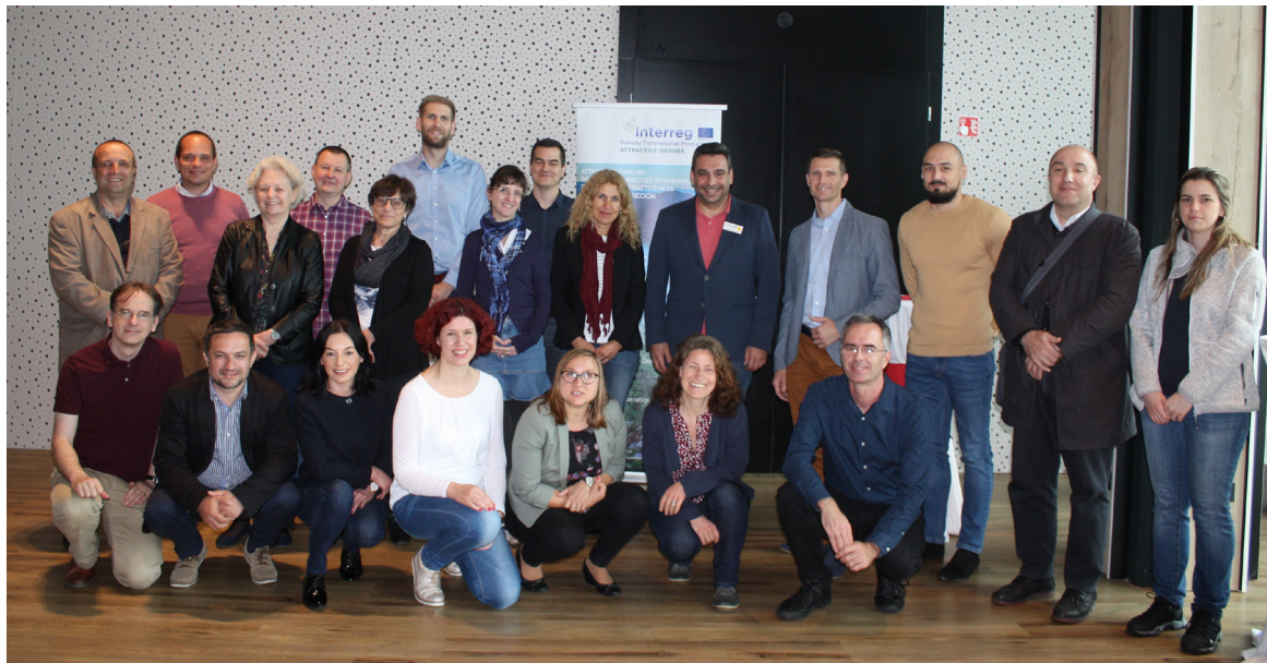
Final project meeting 30 th May, 2019