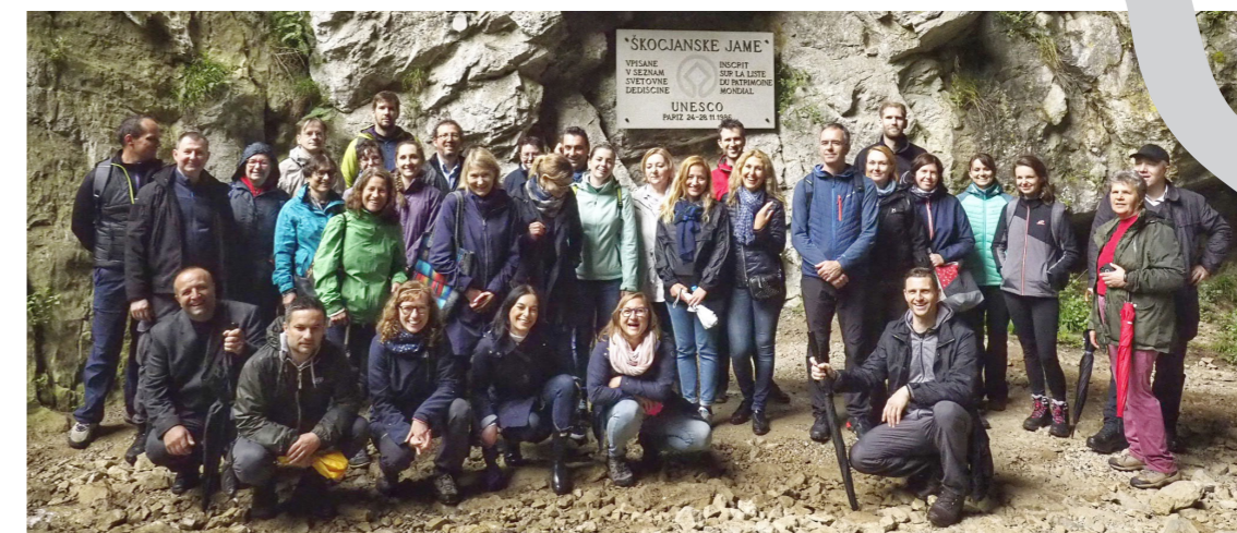
End of the guided tour of the Škocjan caves, UNESCO heritage site, the largest known underground canyon in the world