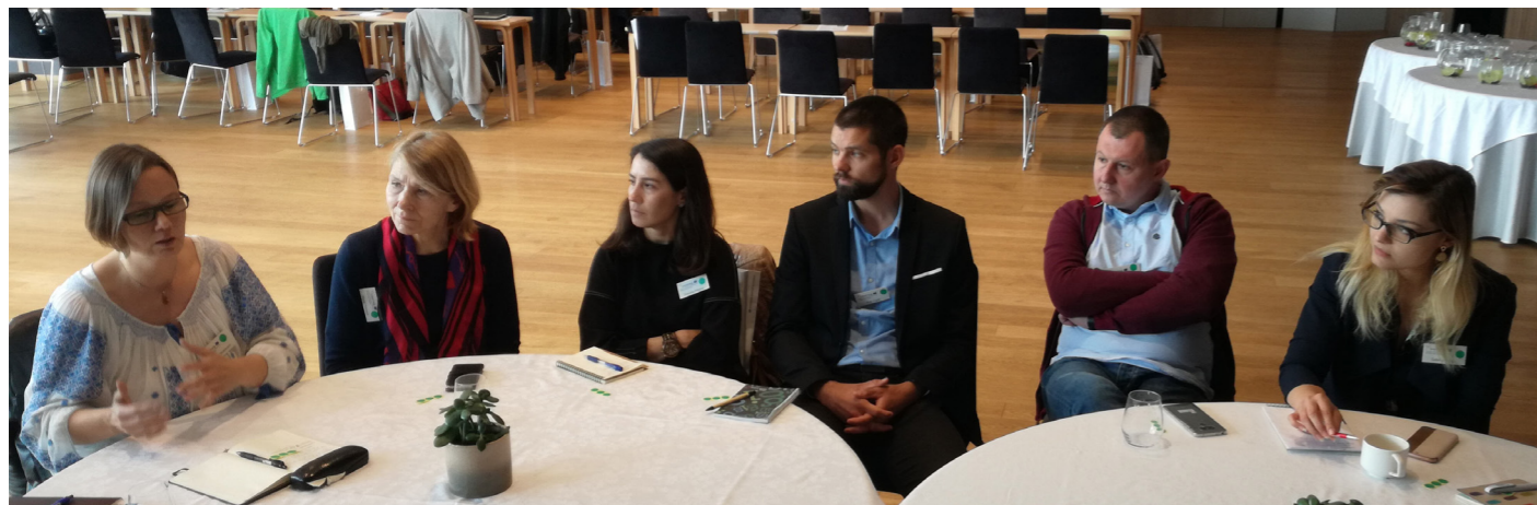
Panel discussion Can sustainability be an attractive development objective for regions in the future?