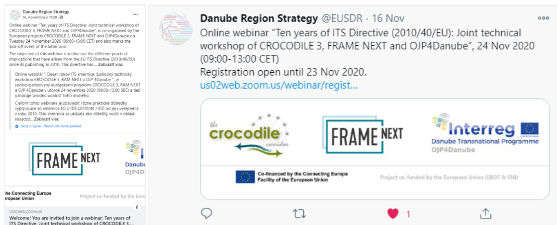
Figure 1. Promotion of the Kick-off dissemination event on EUSDR social media

The event also got support from EUSDR PA1 to raise the visibility and impact in the form of promoting the event on its social media (see Figure 1).