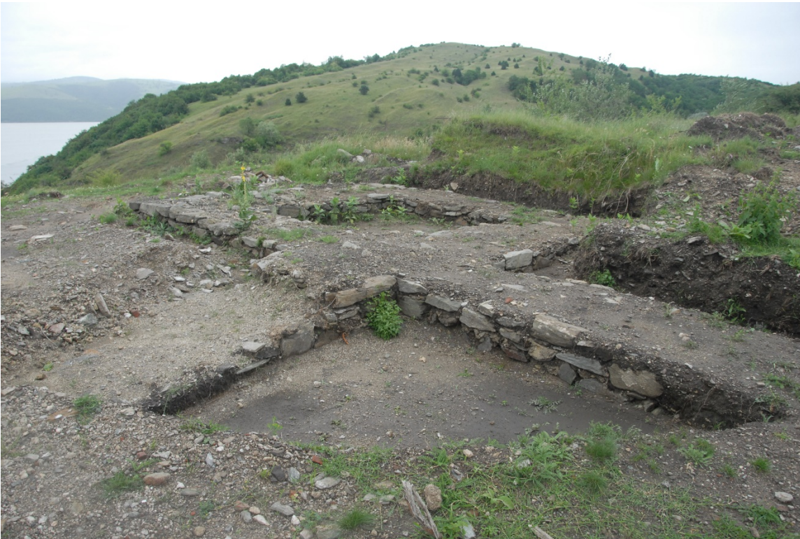
Corner tower, inner fortlet. State of preservation.