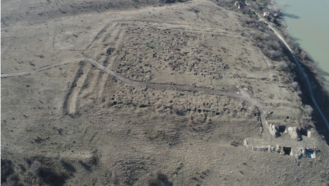
Aerial image of the Lederata from the East.

For years site was exposed to systematic looting until UNESCO Tentative list in 2015. From this point there are plans for site development and tourist visits in order to establish a permanent flow of people and 24/7 protection system.