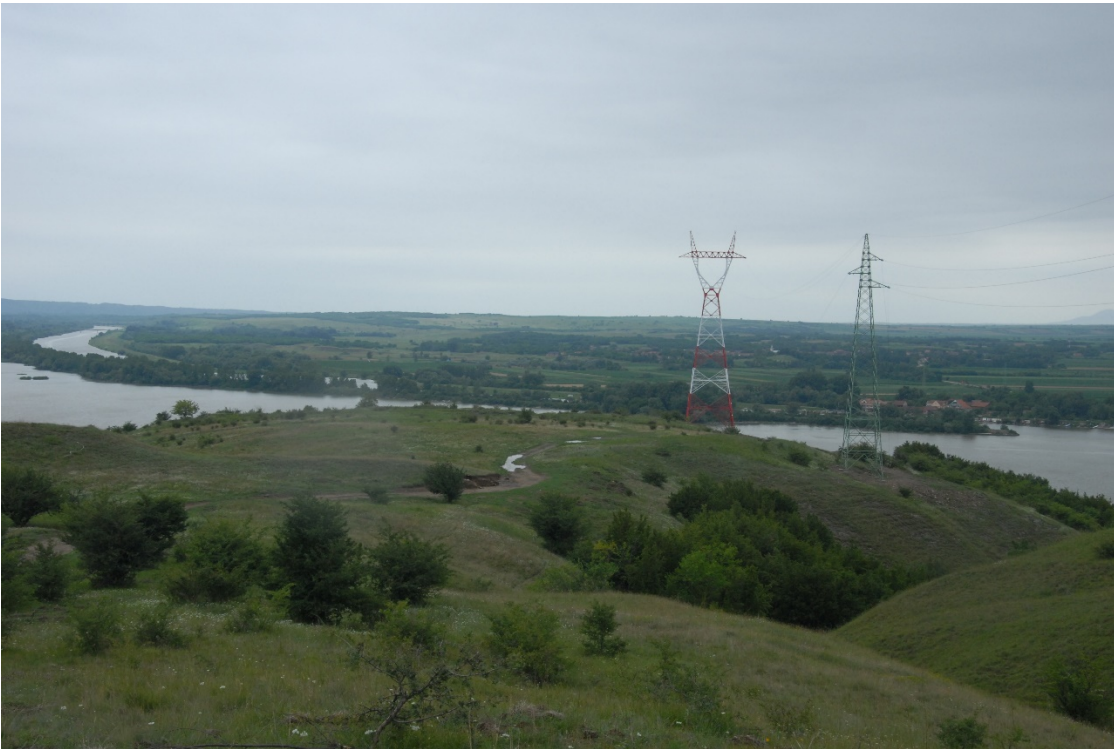
Plateau of the Lederata fort. View from the South East (Source: archive of the Institute of Archaeology).