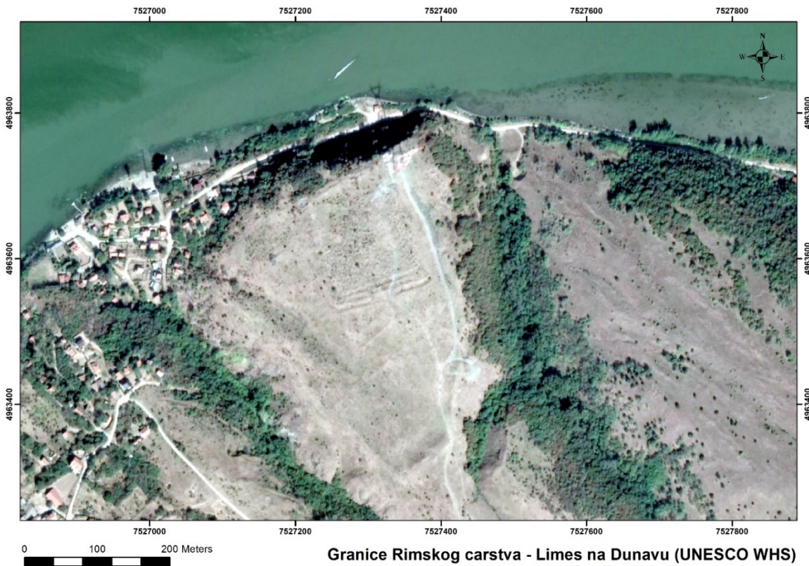
Granice Rimskog carstva - Limes na Dunavu (UNESCO WHS) Ram - Ramska tvrđava i Lederata

Plan of the Lederata fort and its immediate vicinity