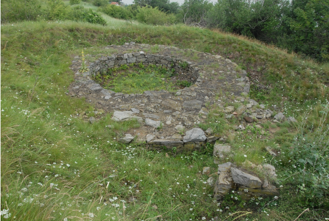
Corner tower, later phase. State of preservation (Source: archive of the Institute of Archaeology).