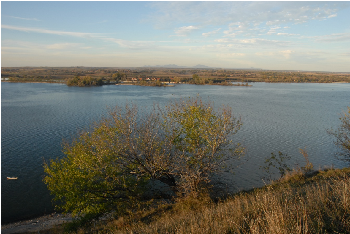
View towards Barbaricum and control of the zone of the river crossing.