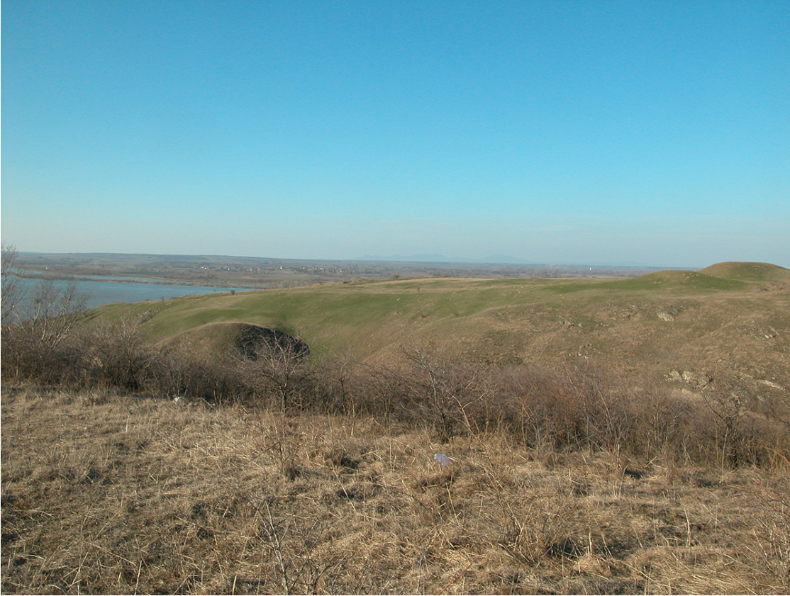
Plateau of the Lederata fort. View from the west.