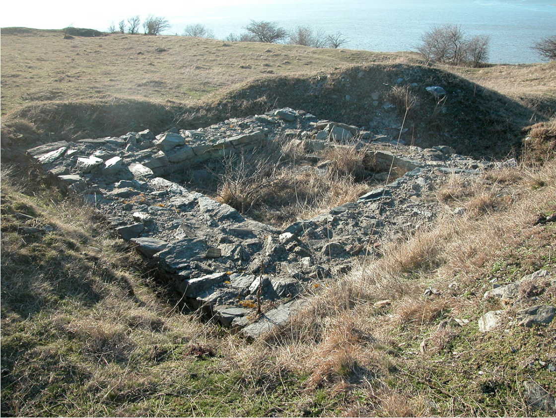
Corner tower. State of preservation.