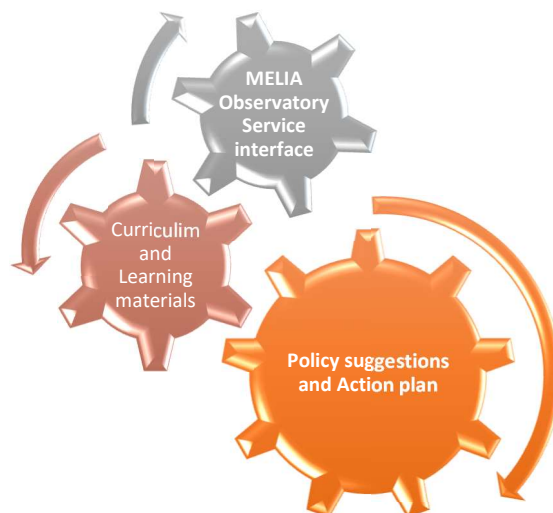
Figure 2: MELIA Observatory interconnected materials for policy-makers

Within the MELIA Observatory, a series of materials as capacity-building tools on media for youth and youth educators were prepared. In parallel to those materials, we developed a multi-purpose interface that provides conditions for learning activities, aiming to support media literacy competencies among youth in the Danube region, boosting in the process civil participation. All below-listed materials will be available to the policy-makers to be used by the end of the project.