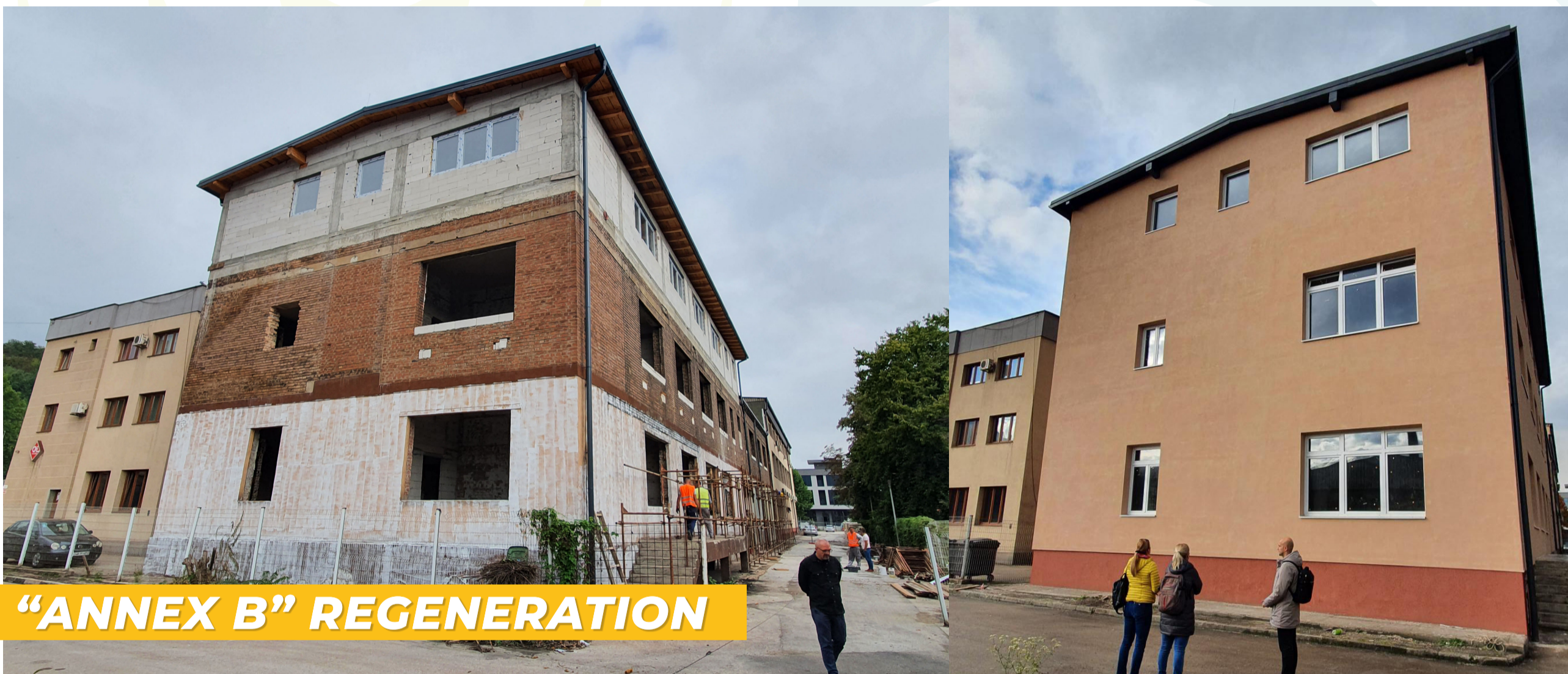
Business Zone Zenica 1