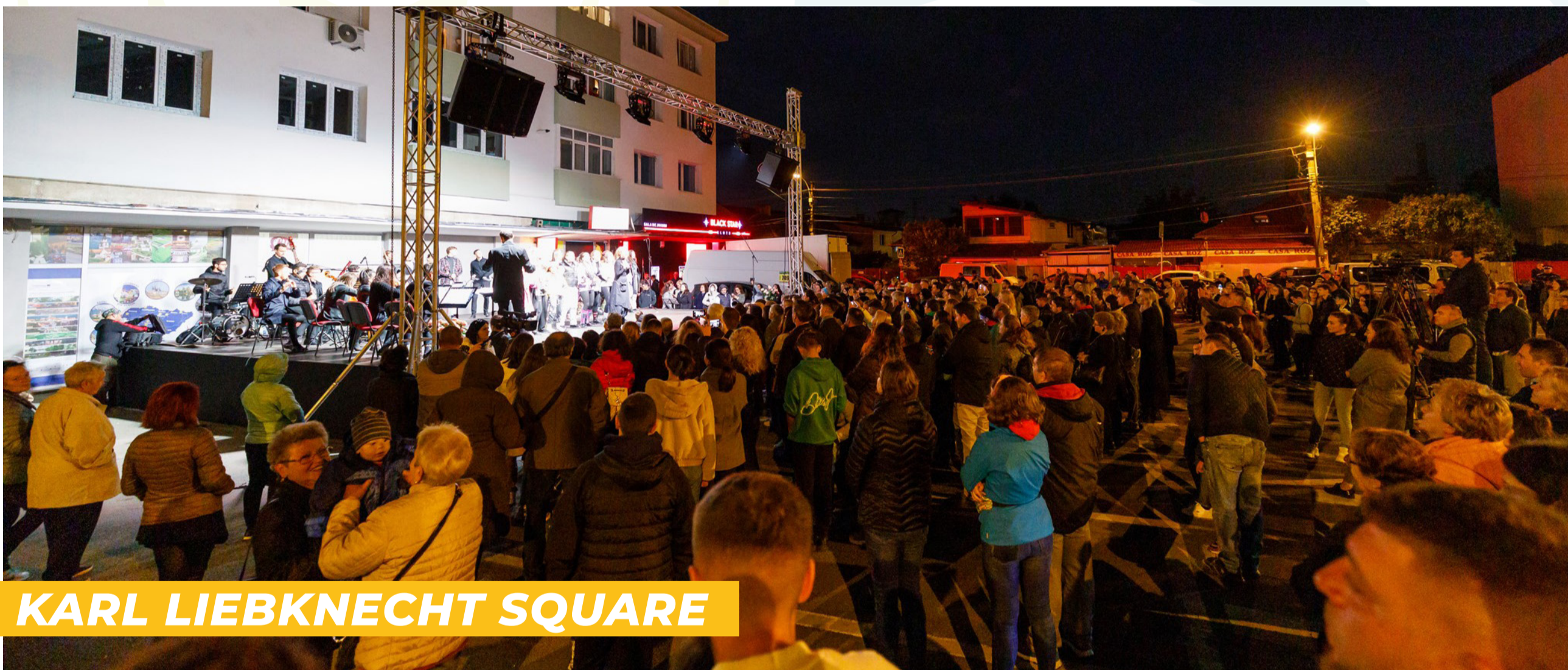
The context of the Iris district