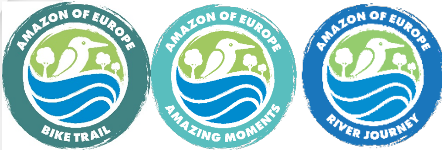
AoE Bike Trail AoE Amazing Moments AoE River Journey