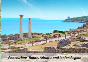
Phoenicians' Route, Adriatic and Ionian Region