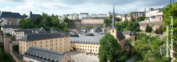
Neumünster Abbey, Luxembourg