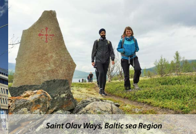
Saint Olav Ways, Baltic sea Region