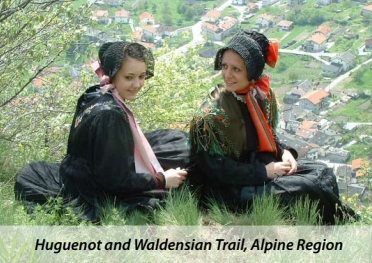
Huguenot and Waldensian Trail, Alpine Region