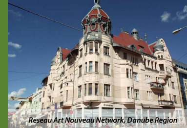
Reseau Art Nouveau Network, Danube Region